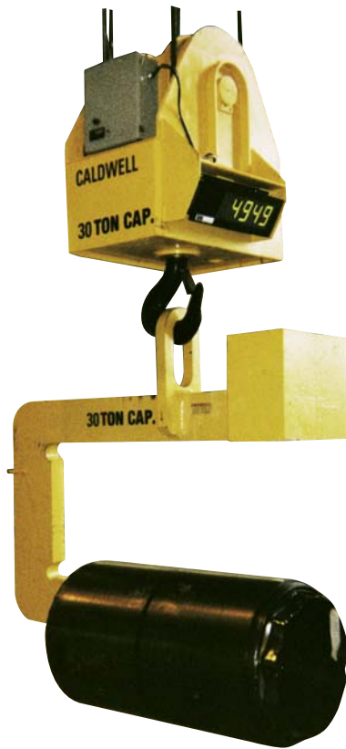
Shown with optional load scale.