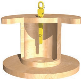
Inserting In Reel