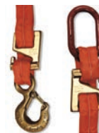
Connect Hook Or Oblong To Sling.