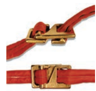
Connect Two Slings (Configuration will affect G-Link™ capacity.)