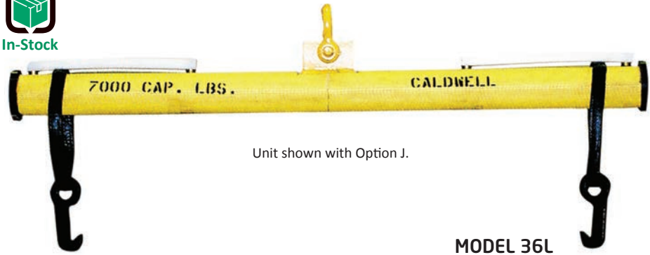
Unit shown with Option J.