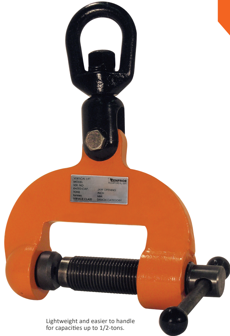
Lightweight and easier to handle for capacities up to 1/2-tons.