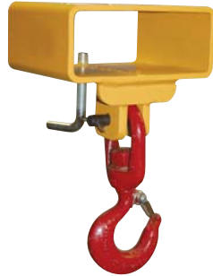
(Swivel hook shown)