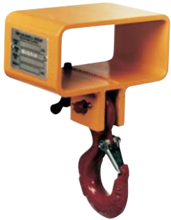
(Fixed hook shown)